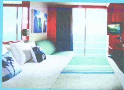
ADDITIONAL OCCUPANCY RATES AND CABIN CATEGORIES MAY BE AVAILABLE UPON REQUEST.